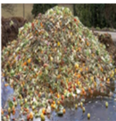
Fruit processing waste