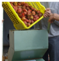
Low-quality cactus fruit