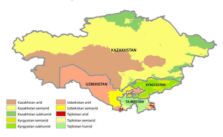
Figure 2: The farming systems of Central Asia

This method yielded results close to the observed situation, even in areas with complex topography, and directly generated climate surfaces. The downscaling method provided absolute deviation of monthly temperature and relative deviation of monthly sum of precipitation from historic data for two future periods (near future: 2010–2040; and late future: 2070–2100). Results showed an expected increase in temperature and precipitation in all considered