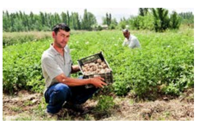
Photo 1: A potato farm in Tajikistan, reeling under climate uncertainties

The integrated model applied for this study (Figure 1) consisted of three main components: (1) climate change projections, (2) yield impacts though crop simulations and (3) economic impact assessments. The climate change