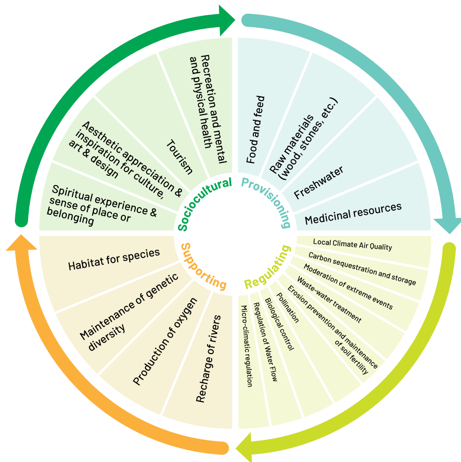
Figure 2. Ecosystem services classification

Crops that are specifically grown for feeding livestock. Browse and herbage which is available as feed for grazing animals or for harvesting as feed (i.e., cut-and-carry, hay, or silage).