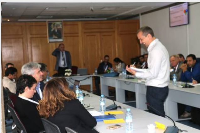
(3) Workshop Participants, November 2019

This all-day event was attended by both project stakeholders and self-funded participants, including students and scientists from international research for development organizations. The sessions featured presentations, workshops, and discussions around key thematic areas including: natural resource management, sustainable land management, conservation agriculture, livestock data, agricultural development solutions, and climate resilience.