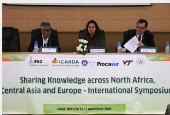
(1) Workshop Participants, November 14th 2019

The events within the workshop were developed to encourage knowledge exchange and systematization of solutions for stakeholders representing rural development institutions, agricultural research extension services, research institutions, universities, and policy informers. Therefore, workshop participants contributed expertise from a wide spectrum of disciplines, including: economics, social science, information technology, engineering and agronomy. The diverse array of perspectives present in the workshop enriched the exchange of knowledge and competences through thoughtful presentations, in-depth discussions, and animated debates. A blog about the events can be found here .