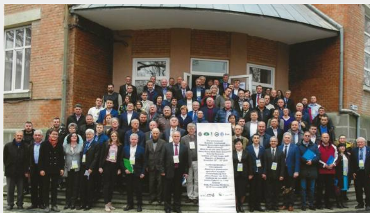
(4) Conference attendees, November 29th 2019

NOVEMBER 29 & 30, 2019 IN BALTI, MOLDOVA