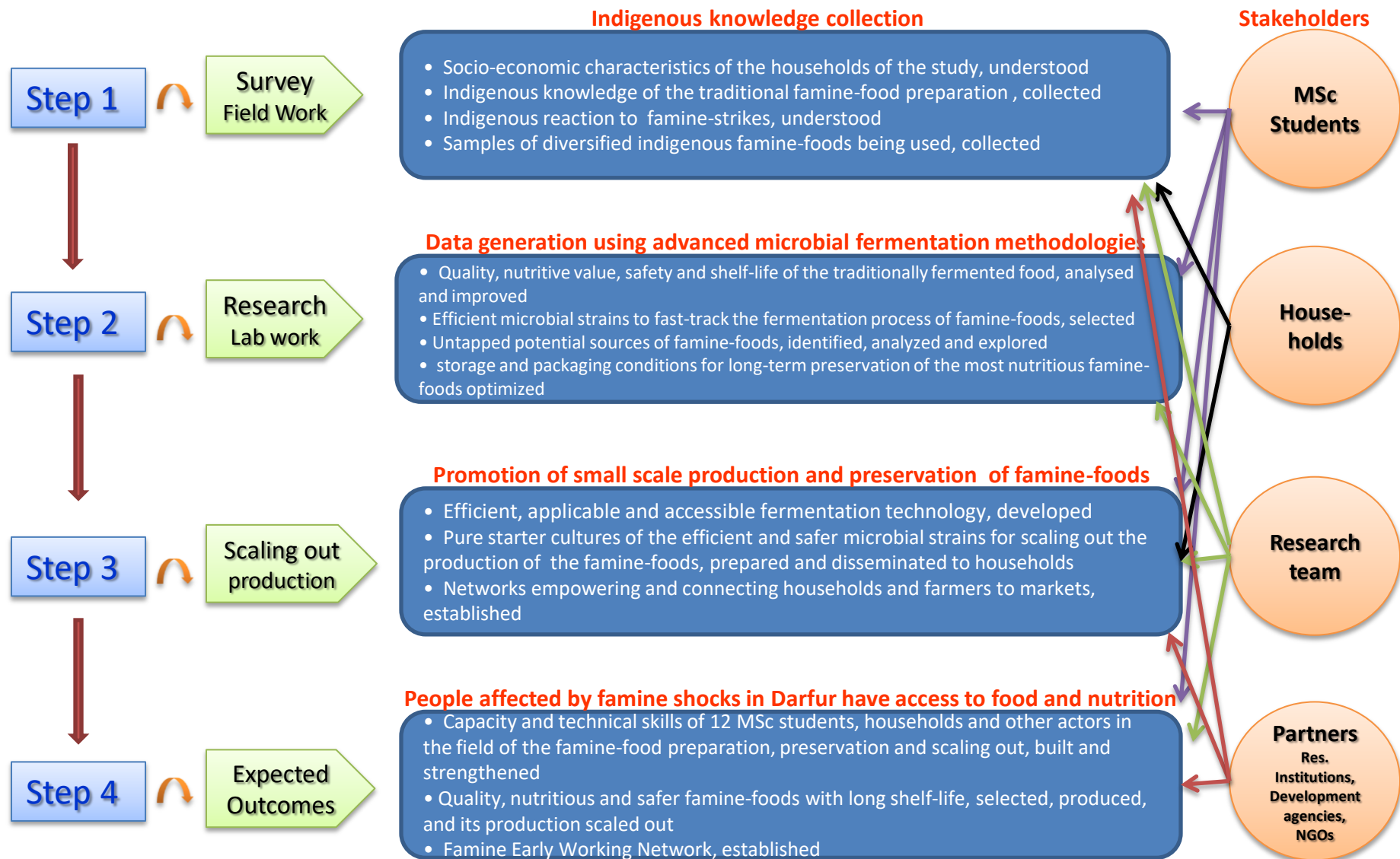
Figure 1: Steps of the Conceptual Framework