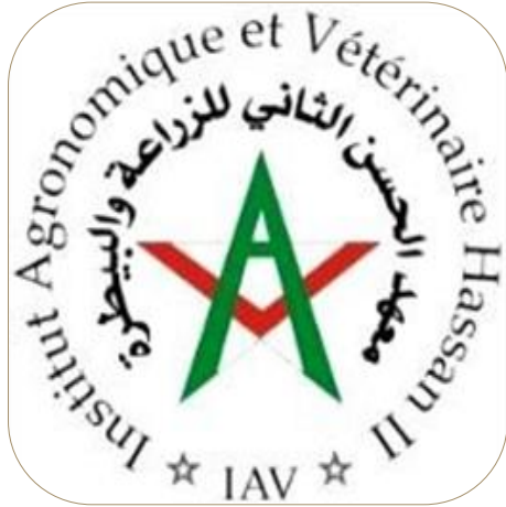
The Hassan II Institute of Agronomy and Veterinary