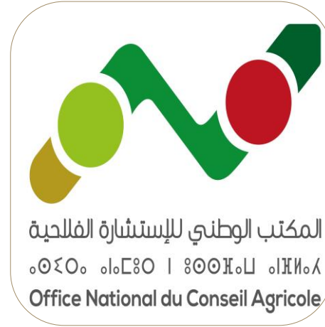
National Office of Agricultural Council