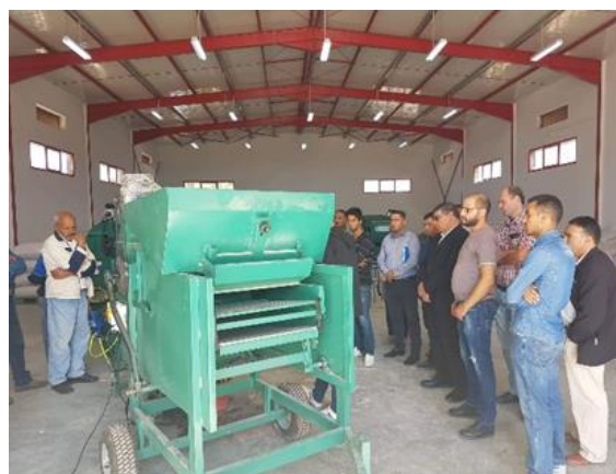
Mobile seed cleaning and treatment unit designed and developed with support from ICARDA.

To tackle this constraint the CRP livestock feed and forage project promoted the use of innovative locally produced seed cleaning and treatment units to develop business for lead farmers and SME around forage seed production. After discussing with national partners (INRAT 4 , OEP and INGC 5 ) the business idea was found more suitable for small or medium SMSA (Société Mutuelle des Services Agricoles) as the machine would benefit more farmers. SMSAs are a kind of farmer cooperatives providing services to their members. The cooperatives can provide seed cleaning and treatment services for their members. The business can help to provide additional income for the cooperative and forage seed production of their members. The seeds are used by the members themselves.