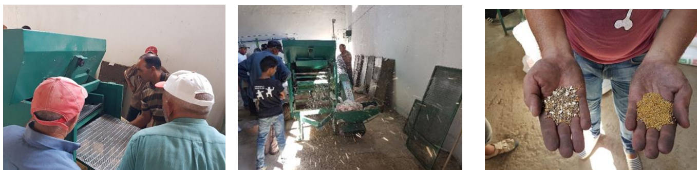
Fig 3 – 5: Changing sieves, cleaning unit in action, cleaned seeds