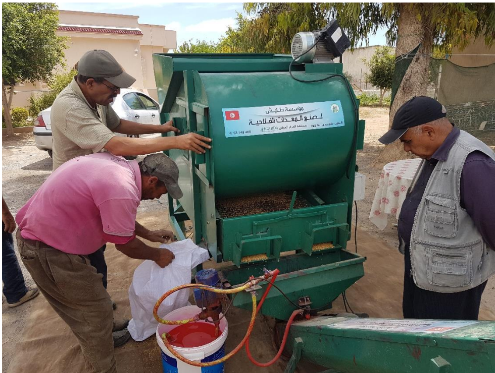
Fig: Testing of mobile seed cleaning machine

2 Office de l'Elevage et des Pâturages / Livestock and Pasture Office (OEP), Tunis, Tunisia