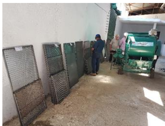
Fig 2: Different sized sieves for legume seeds

A total of 11 sieves (2-3 per coop) were co-financed by the project. As cooperatives are increasingly satisfied with the technology, ownership has increased; hence the project subsidy could be reduced to 50% of the sieve prices. One additional sieve costs 800 TD (300$).