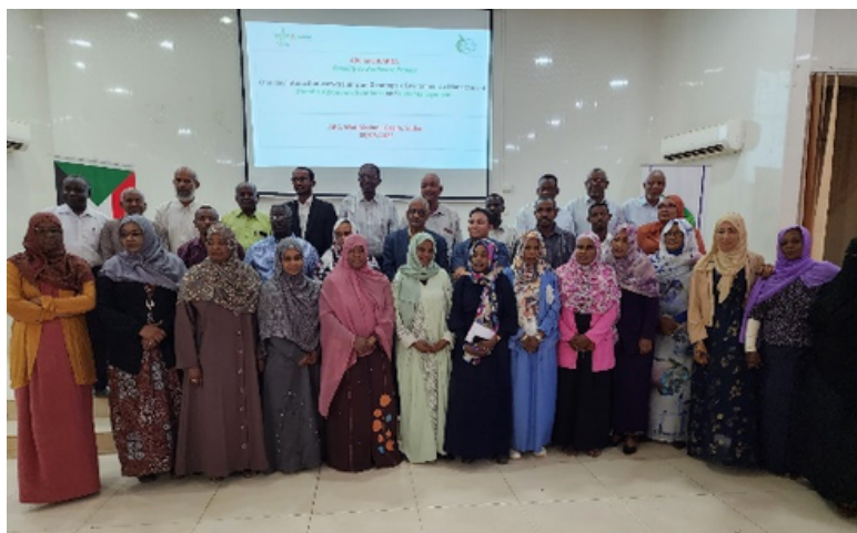
Photo: Agronomy Community of Practice members in Sudan

ACoP is the collaborative network of scientists and experts within each country to exchange scientific knowledge, implement training initiatives, and implement collaborative research to enhance food and nutritional security. ACoP aims to cultivate discussion of scientific ideas, innovations, joint publications, local knowledge utilization, development of context-specific agricultural solutions, identify research gaps, and refine recommendations to improve economic and environmental benefits from crop production. The mobilization and functioning of ACoP is governed by established rules and regulations that have been developed in consultation with all members. Membership in this CoP is open to individuals who actively contribute to the country's agricultural development from the National Agricultural Research and Extension System (NARES), teaching universities and institutes, national and international organizations, private sectors, value chain stakeholders, and civil societies. Up to now, ACoP includes 18 agriculture experts in Egypt, 40 in Sudan, and 26 in Uzbekistan.