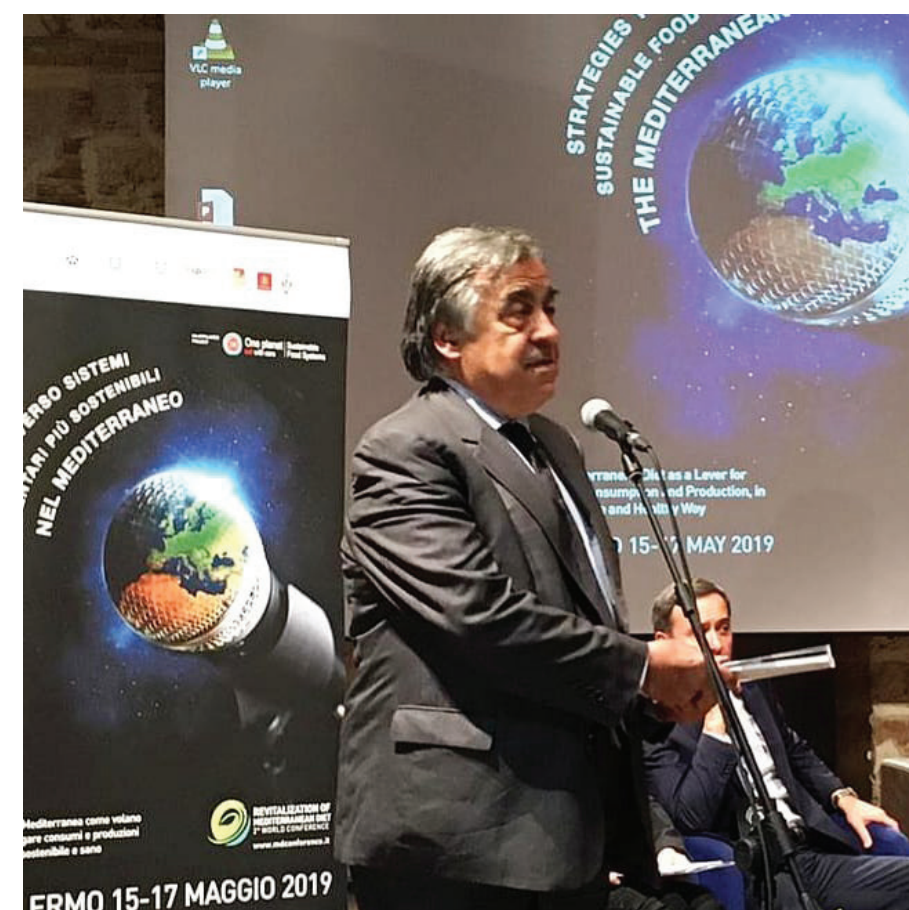
Leoluca Orlando, Mayor of Palermo

The impacts of poverty and unemployment have contributed to social marginalization, which is further compounded by income disparities, and gives rise to social and political instability. Mounting economic, social, and environmental strains and their resultant implications on livelihood security make the situation unsustainable in NENA countries.