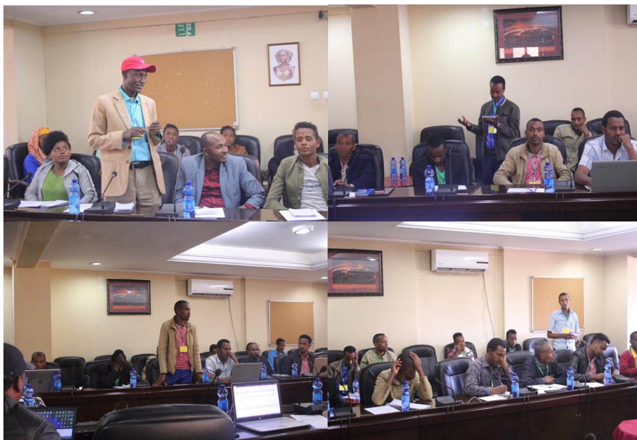
Fig 1: Plenary sessions on feed resource availability and feeding options

Representatives from each youth group shared their knowledge and utilization of feed resources in their sites.