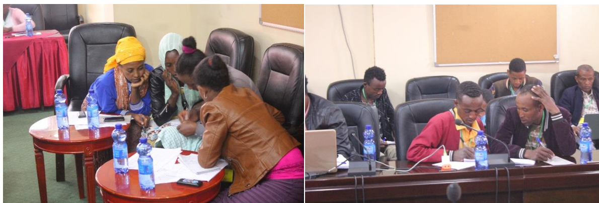
Fig 2: Group work on challenges and opportunities