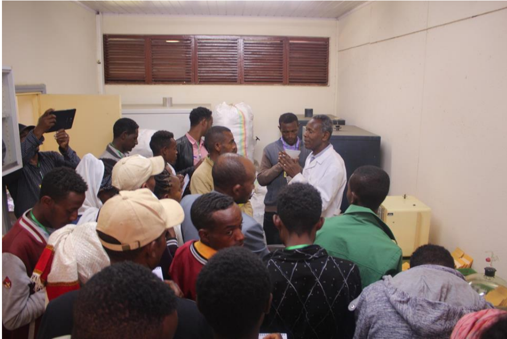
Fig. 3: Visit to ILRI nutrition Lab.