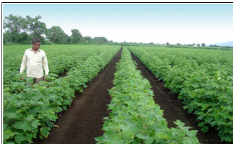
Farmer inspects his cotton crop in Makhiyala village of Junagadh district.

In the two villages of Junagadh, the average farm size is 1.58 ha. In 2013-14, half the farmers grew coriander and cumin in the postrainy season rather than cotton and other crops, making a profit of ` 100,000-125,000 per ha (US$ 1,666-2,083 per ha) from cumin. They have reduced the area under groundnut, coarse grains and pulses (Figure 1). Land is increasingly left fallow due to scarce labor, water-logging or scanty rainfall.