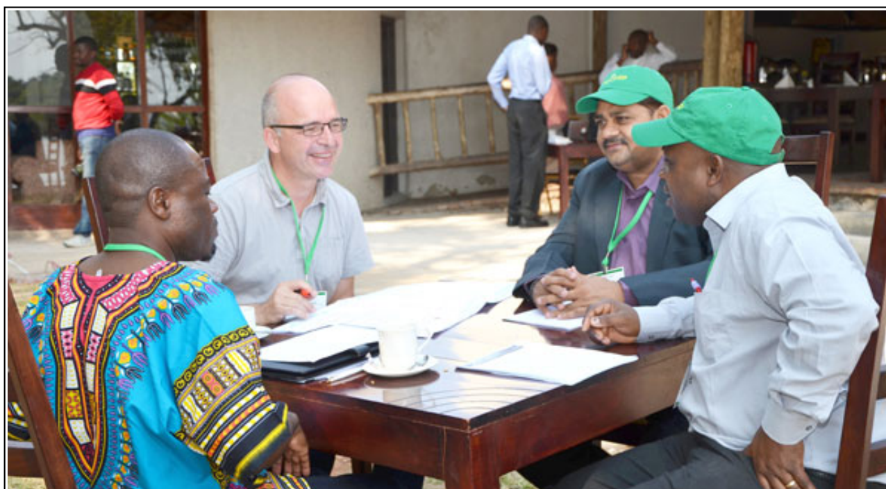
Small group discussions on targeting appropriate stakeholders with AgMIP research messages and providing visualizations useful for decision making.

While adaptation to climate change brings benefits in terms of reducing vulnerability, it does not always translate into substantial monetary gains. Key messages such as this were shared at a workshop organized as part of the Agricultural Model Inter-comparison and Improvement Project (AgMIP) in Zimbabwe.