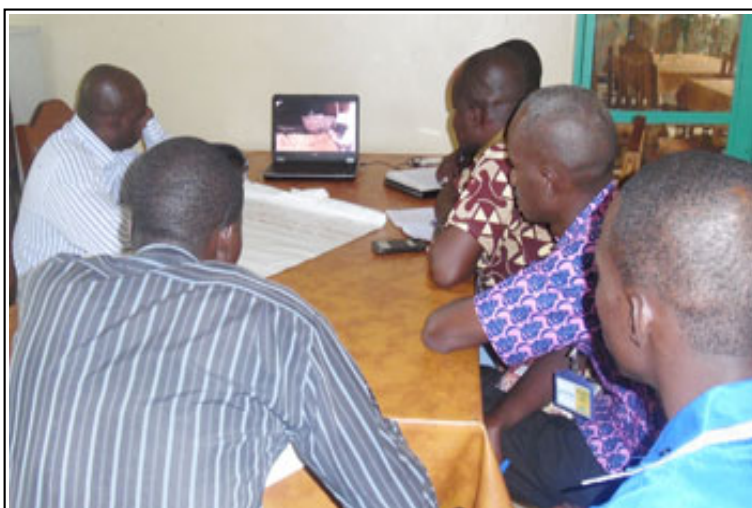
A working group watches a video to develop learning around the core technology presented in it.

The methodology followed was participatory and included watching videos. Participants felt that the video approach greatly facilitated their understanding of the topics, and this would make the training of farmer groups much easier. They received a copy of the video series 'Fighting Striga', and were registered on the agriculture website, so as to receive information on new video releases.