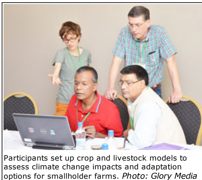
Participants set up crop and livestock models to assess climate change impacts and adaptation options for smallholder farms.

which could involve new partnerships with research organizations such as ICRISAT.