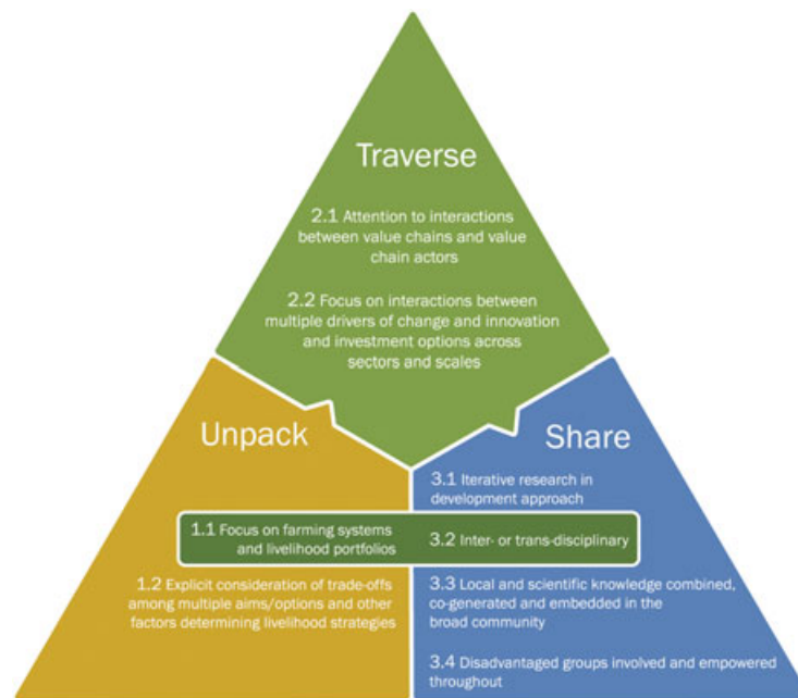
Figure 1. Three integrative principles that can operationalize the new dryland development paradigm. The principles provide a checklist for researchers and an evaluation framework for funders using the new DDP. The principles suggest that dryland development research must Unpack relationships, Traverse scales and sectors and Share knowledge. Each principle comprises a number of characteristics, two of which (1.1 and 3.2) cross-cut two of the principles. [Colour figure can be viewed at wileyonlinelibrary.com ]

Appendix S2 and summarized here under each integrative principle. Table S6 provides exemplar case studies from the CRP-DS in which the principles are operationalized together, with cases ranging from local and national to global studies, across a range of agricultural systems.