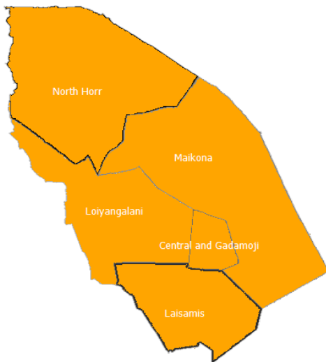
Previous Index readings for Marsabit