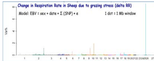
Figure 2. Genome-wide association of respiration rate change trait in Egyptian desert Barki sheep breed

Several candidate QTLs that influence, for instance change in respiration rate, including genes with roles in heat generation, detection of temperature stimulus and homeostasis were identified on goat chromosome 7. In sheep, genes regulating cellular amide metabolic process, playing a role in single organism cell adhesion and small nuclear RNA, all present in chromosome 25 were found to be associated with RT change (Figure 2).