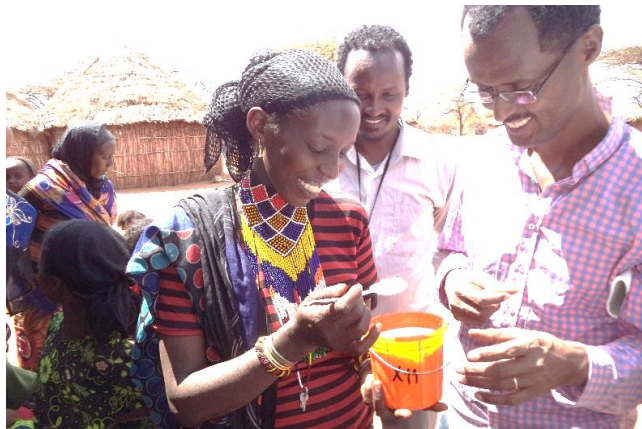
Use of dairy culture in Ergo production in Tigray region