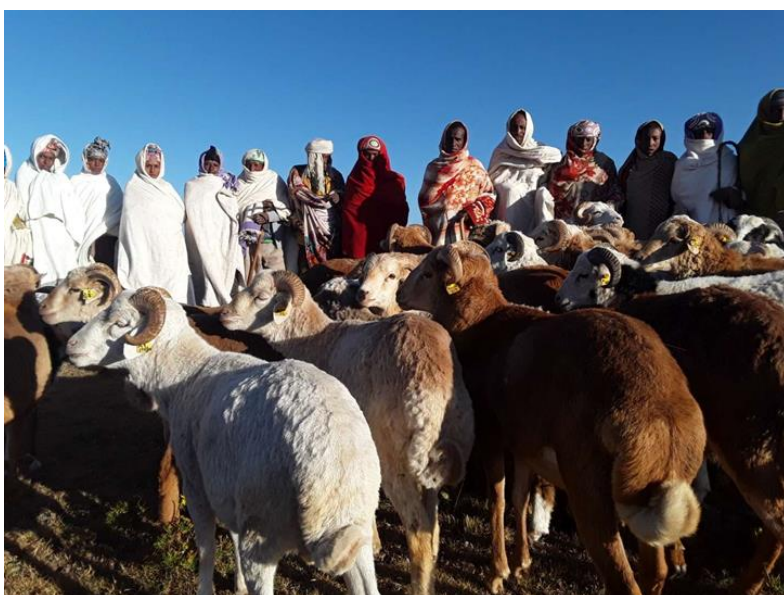
Fig. 9: Youth group members of Dargegne Kebele showcasing their fattened rams during the field day in Menz