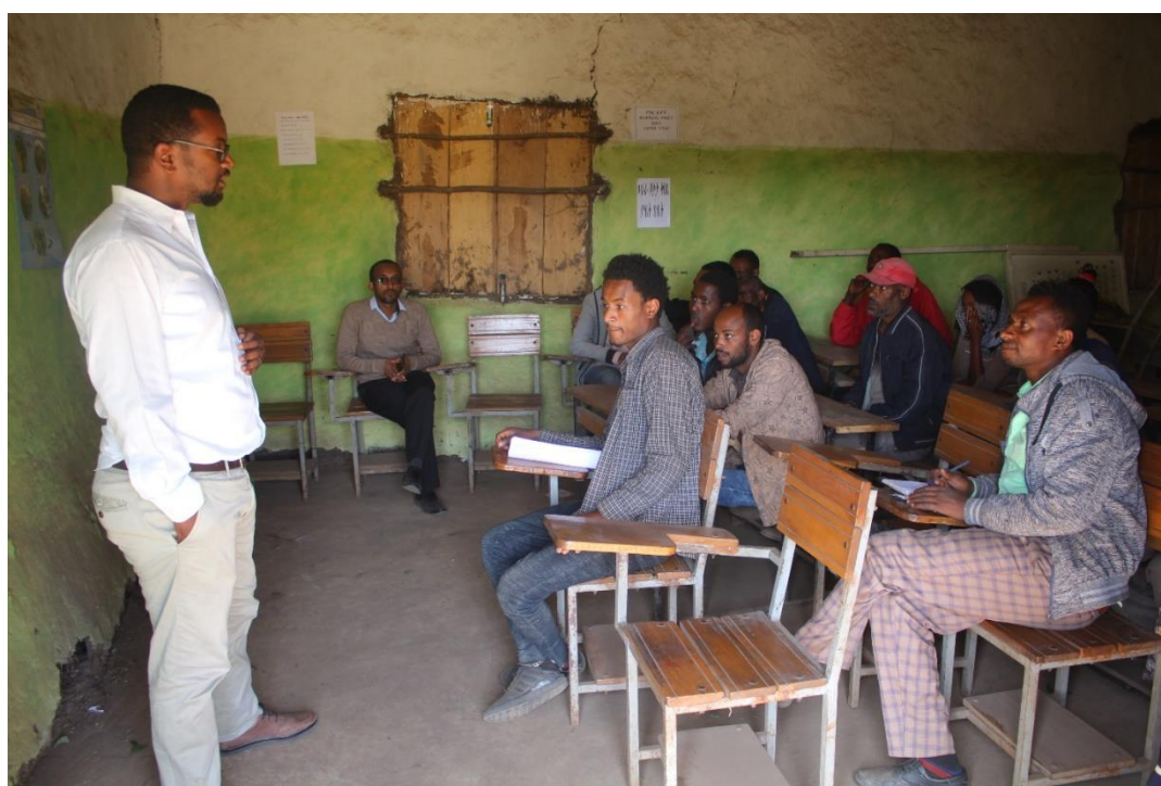
Fig. 4: Entrepreneurial Skills Development training to youth groups in Hawora, Doyogena

The trainers listed potential challenges in the operationalization of youth groups in the areas of group dynamics, animal feed and fodder, market linkage, finance and weak partnerships among development actors. They listed the following challenges as echoed by trainees: