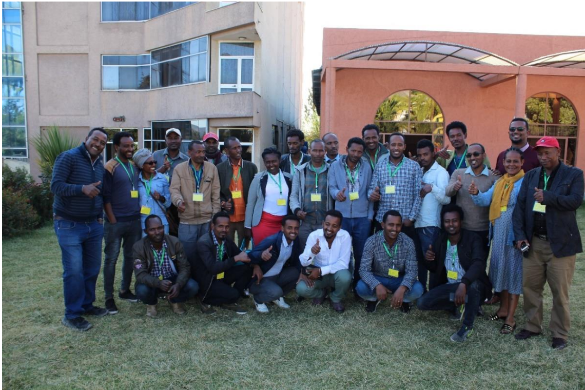
Fig. 1: Training of Trainers in Entrepreneurial Skills Development in Debre Berhan, 31 December 2018