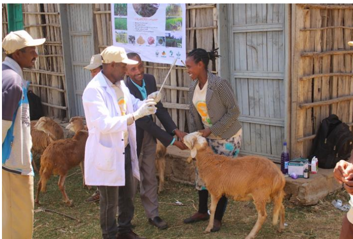
Fig. 11: Female youth group member assists in vaccination of rams during the field day at Hawora, Doyogena.