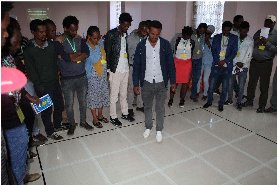
Fig. 2: Activity games in Entrepreneurial Skills Development in Debre Berhan, 31 December 2018