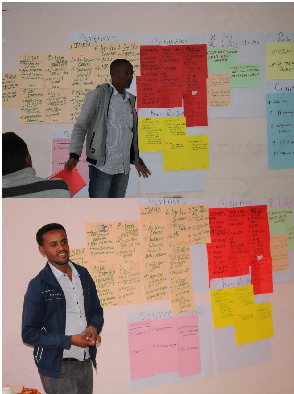
Fig. 3: Development of business models by participants during the Trainer of Trainees Entrepreneurial Skills Development training in Debre Berhan, 2 January 2019