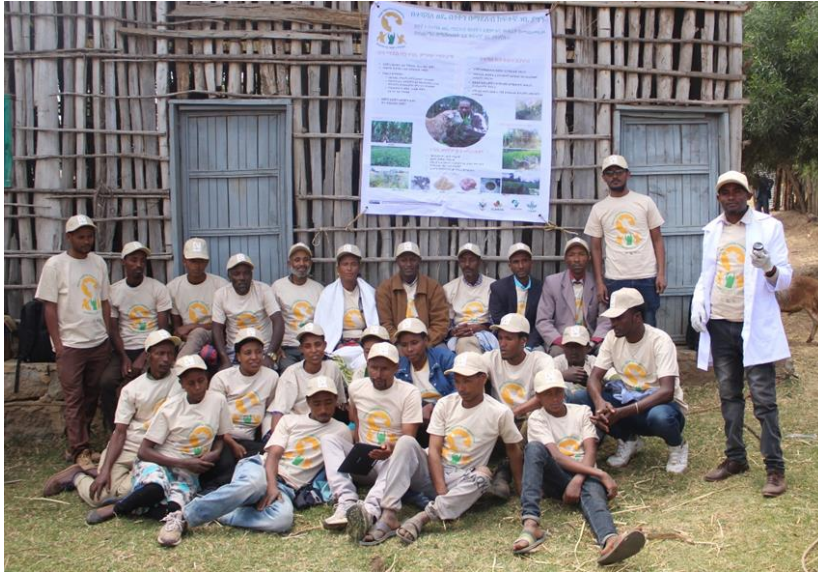
Fig. 10: Youth group members and champions during the open field days at Serera, Doyogena