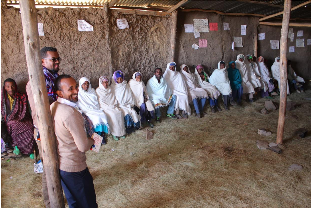
Fig. 6: Entrepreneurial Skills Development training to Mehal Meda Youth group, champions and development agents in Menz.