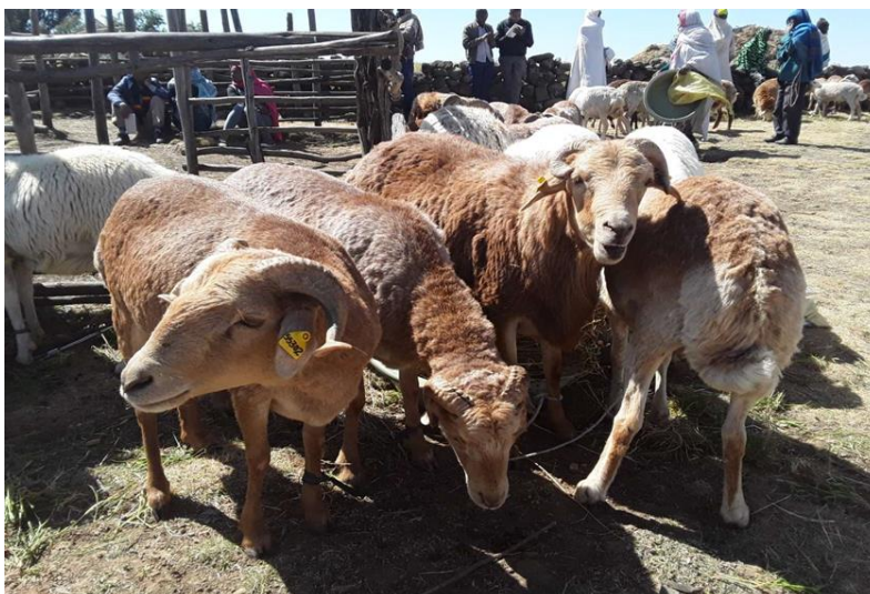
Fig. 8: Field day in Mollale site, Menz.