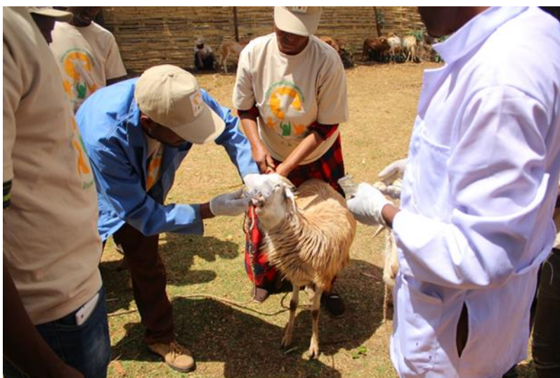
Fig. 12: Ram vaccination during field day in Modiyo, Bonga.