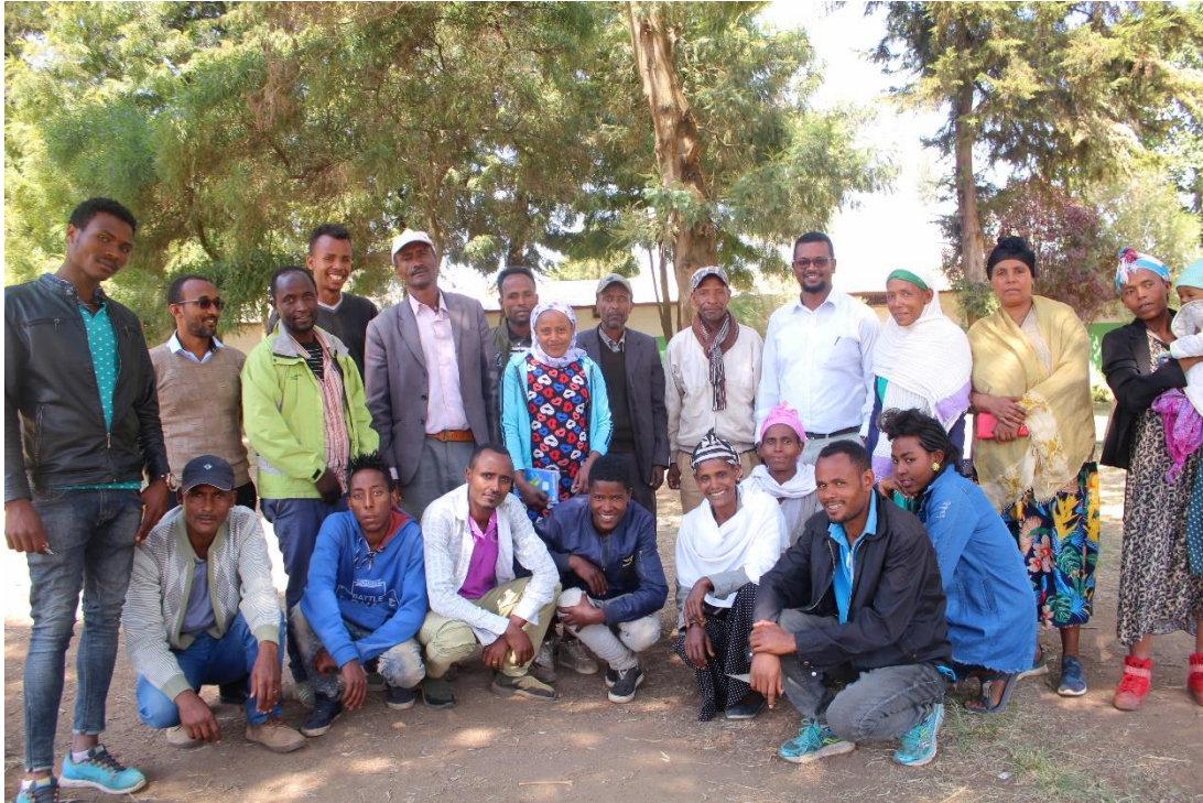
Fig. 5: Entrepreneurial Skills Development training to Telo-Yama youth group, champions and development agents in Bonga.