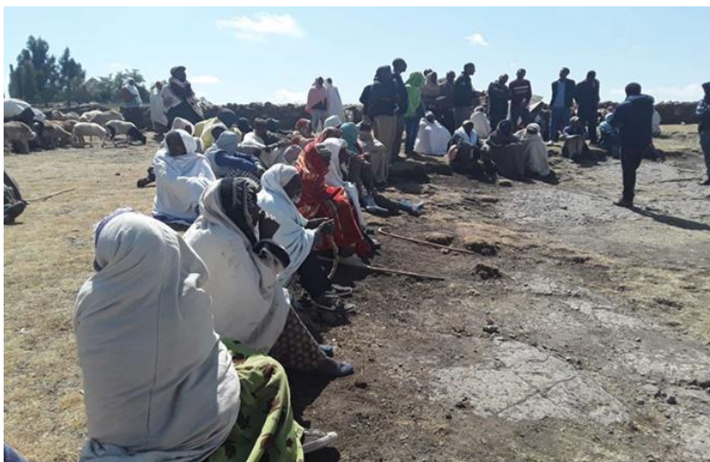
Fig. 7: Farmers attending on the field day at Yecha, Menz area