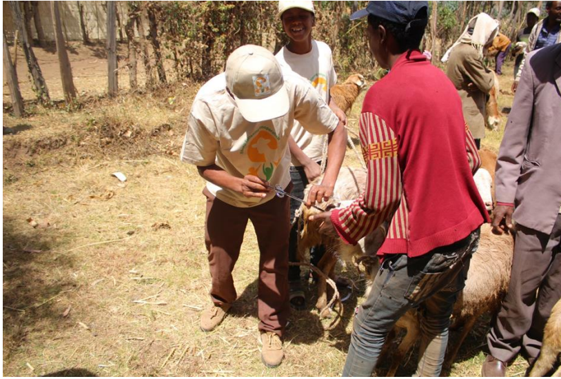
Fig. 14: Free Deworming Service by youth group members at Meduxa Kebele field day in Bonga