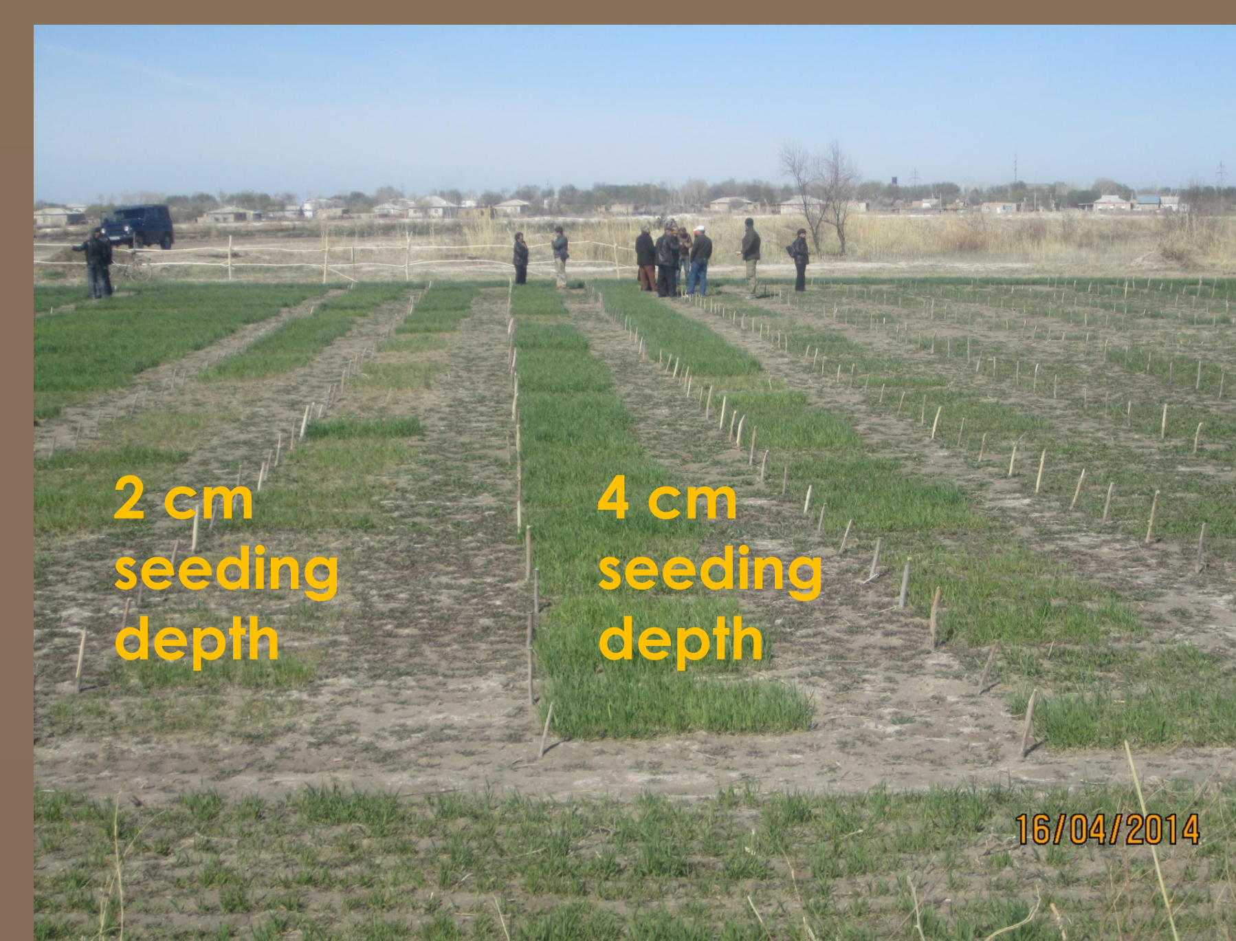
Fig.3. Higher frost damage at 2 cm than 4 cm seeding depth; crop on 16 April 2014, Nukus, Uzbekistan