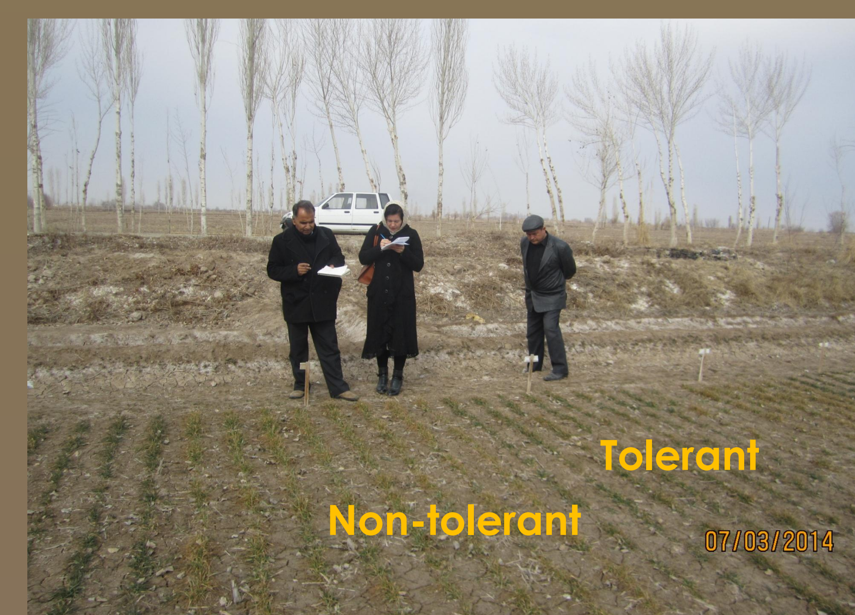
Figure 2. Evaluation of frost damage in February, evaluated on 7 March 2014, Urgench, Uzbekistan.