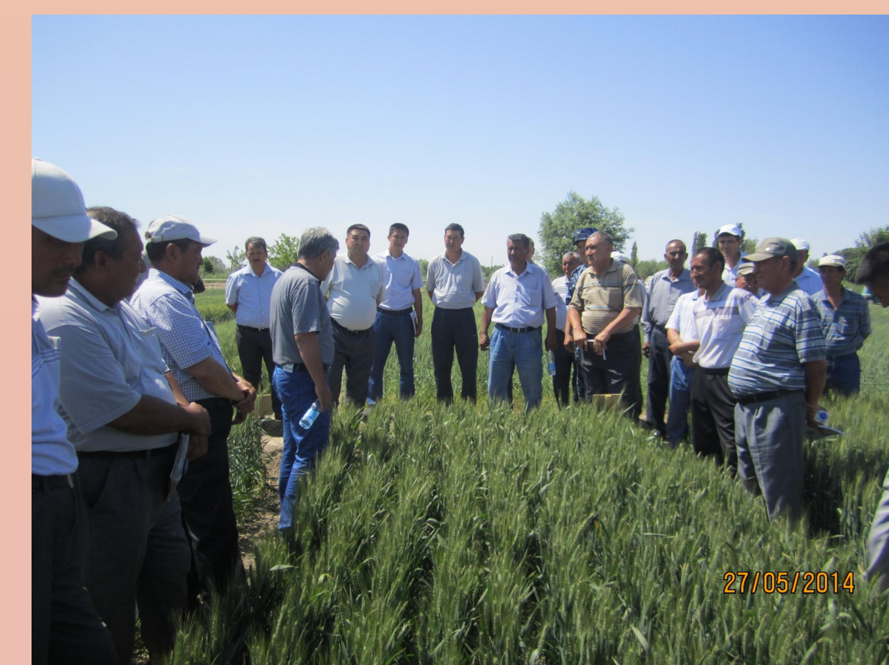
Fig. 5. Farmers and researchers evaluating frost tolerant wheat, 2014, Nukus, Uzbekistan

The study in 2014 was conducted as CRP1.1 (Dryland Systems) activity by ICARDA. The study in 2013 was conducted under BMZ/GIZ funded project to ICARDA in Central Asia.