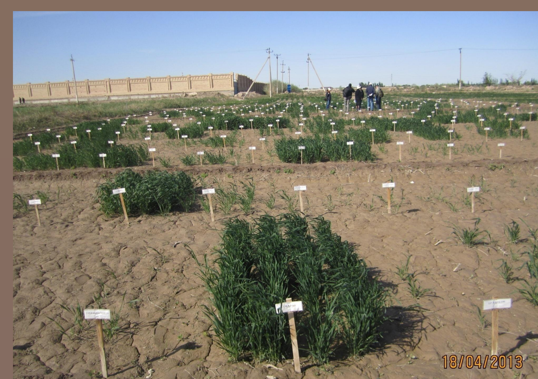
Figure 4. Frost damage caused in December 2012, crop on 18 April 2013, Urgench, Uzbekistan