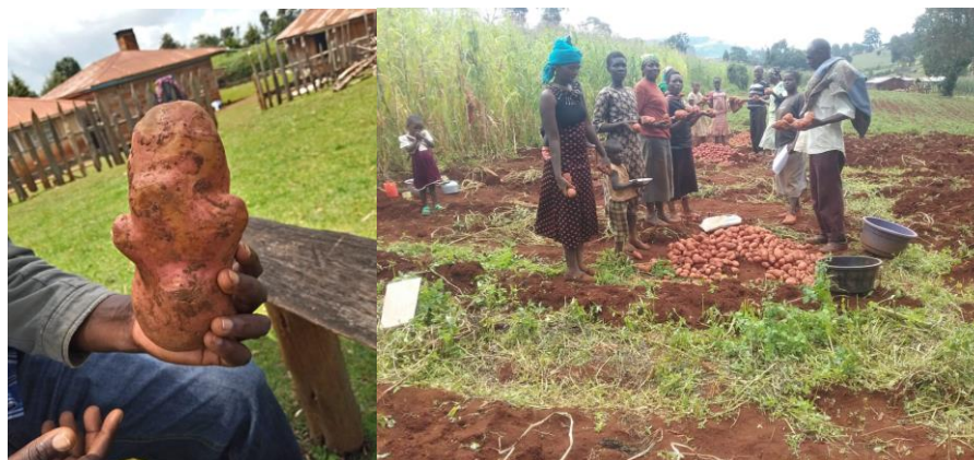
Photo 3. Post from the AVCD Potato WhatsApp group. Farmers show off the good harvest of 'Unica' in Bungoma county.

dominant variety 'Shangi', but the training exposed them to more resilient varieties 'Sherekea' and 'Unica', which outperformed 'Shangi' largely due to resistance to LB (Table 6 and Photo 3).