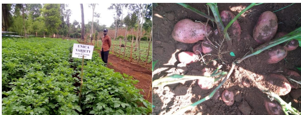
Photo 2. Post from the AVCD Potato WhatsApp group, showing a good field crop of ‘Unica’ (left) and high number of tubers (>15) per plant (right).

a Mean of highlighted yields at sites with 114–118 mm of rain.