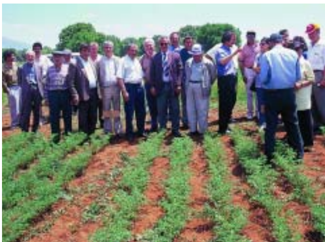
Researchers, farmers, extensionists, and processing industry representatives evaluate chickpea for producing leblebi (a popular snack) in Turkey.

Major activities have included evaluation of germplasm for cold tolerance at Hymana and Eskisehir research stations. A large number of cold-tolerant lines have been identified and used in the breeding program. In addition, a large number of chickpea lines resistant to Ascochyta blight have been identified from ICARDA-supplied materials for release in Turkey. One of these lines, 'Gokce' (FLIP 87-8C), which is large seeded, occupies more than 40,000 hectares.