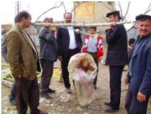
Determining the weight of a lamb during surveys conducted by the GAP/ICARDA team.

team to Jordan to see the cooperative milk production sector involving small-scale sheep milk producers.