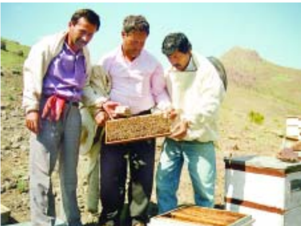
Farmers and scientists work together to improve techniques of bee-keeping in the Taurus Mountains, Turkey.

The project led to the development of improved varieties of wheat, barley and chickpea which have been widely adopted by the farmers. Also, new enterprises were introduced to diversify the incomes of farmers. These included the vetch-oat combination, triticale, sainfoin, and new fruits such as cherry and grapes. Livestock production was also improved. The changes of breeds in animals (cattle, sheep and goat) significantly increased the incomes of farmers. As a result of these technological changes, the incomes of the farmers involved in the project increased by 65%. This project may be considered a model for agricultural development through research, with the participation of farmers, extensionists and researchers.