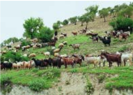
Improving range, forage and small ruminant production.

flock management. The target was to promote better milk and meat yields. Researchers were also trained in strategies for collecting and recording data from farmers. To further enhance the experience and information exchange, ICARDA organized a visit of the GAP research/extension