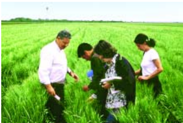
On-farm technology demonstration/testing and seed production.

The introduced material is monitored and evaluated by GAP staff, local extension personnel and ICARDA scientists. Improved cultivars of these crops in demonstration fields produce higher yields than local cultivars. Varieties derived from ICARDA germplasm that are now popular with GAP farmers include 'Gidara 2,' an improved durum wheat variety, chickpea varieties 'Gokce' and 'Diyar 95,' and lentil variety 'Firat 87.'