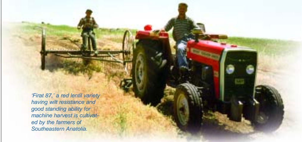
'Firat 87,' a red lentil variety having wilt resistance and good standing ability for machine harvest is cultivated by the farmers of Southeastern Anatolia.

Southeastern Anatolia, where lentil is grown on about 350,000 hectares, mostly the red type, is the most intensive lentil-growing area in the world. However, the region faces a major problem of wilt, which limits production. SARRI is working with ICARDA to develop wilt-resistant, high-yielding red lentil varieties for winter planting. Among the varieties released, 'Firat 87' and 'Syran 96,' which combine wilt-resistance with good standing ability for machine harvest, have been adopted by the farmers in Southeast Anatolia. 'Firat 87,' locally known as "Commando," is popular with consumers for its roundish seed shape. Recently, ICARDA supplied 19 tons of a popular variety 'Idlib-3,' released in Syria, to Turkey to increase adoption and impact. SARRI has also selected a large number of ICARDA germplasm from international nurseries for use in hybridization and further evaluation in various parts of the region.