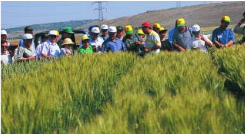
Traveling workshop in Turkey on winter wheat improvement.

The major aim of the project is to provide durum producers, especially resource-poor smallholders, with opportunities to improve their agricultural income and welfare by adopting productive, low-cost, sustainable technology options compatible with their production and consumption needs. It also provides feasible and low-cost alternatives for broadening the income base of smallholders through the development of income-generating activities, especially for women.