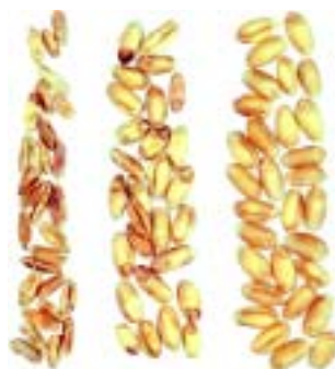
Sunn pest damaged grain (left and middle) and undamaged grain (right).

Turkey has been involved in various ICARDA projects aimed at controlling Sunn pest. One of the projects, funded by DFID, aims at reducing constraints to wheat production caused by Sunn pest through the development and application of appropriate, low-cost and environmentally acceptable IPM approaches. Since 2001, the project has been implemented in collaboration with NARS of Iran, Syria and Turkey and the University of Vermont (USA), CABI Bioscience and the University of Greenwich, UK. In Turkey, the collaborating institutions are the Plant Protection Research Institute, Adana; Adana Mustapha Kamal University; and the University of Cukurova.