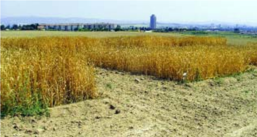
Supplemental irrigation trials at Ankara Research Institute of Rural Services.

collaborative activity under ICARDA's On-farm Water Husbandry series entitled "Supplemental Irrigation Potential for Wheat in the Central Anatolian Plateau of Turkey."