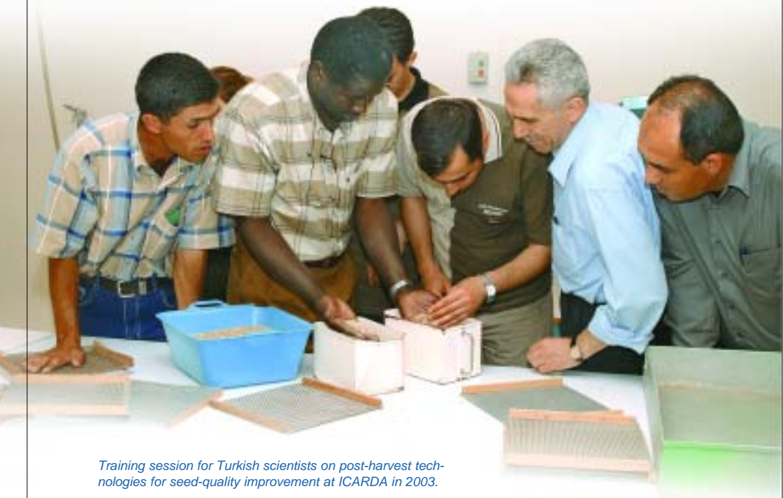
Training session for Turkish scientists on post-harvest technologies for seed-quality improvement at ICARDA in 2003.

One of the key components of ICARDA's work is the capacity building in national agricultural research institutions through training of scientists and supervision of post-graduate studies, short- and long-term training courses, conferences, traveling workshops and scientific seminars. More than 500 scientists from Turkey participated in training activities conducted by ICARDA from 1978 to 2004. Areas of training included seed production and technology, crop improvement, cereal physiology, biotechnology, food legume entomology, DNA molecular marker techniques, experimental station operations management, experimental designs and field plot techniques, expert systems, GIS/RS, natural resources management and data analysis, and scientific writing.