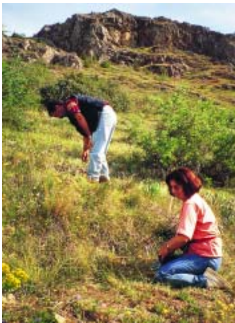
Collecting wild relatives near Burdur in Turkey as part of a joint collection mission of ICARDA and the Aegean Agricultural Research Institute.

Many of the crops that were originally grown in Turkey have adapted to cold and drought, pests and diseases, and can be useful in breeding varieties with similar traits. Given the country's diverse agroclimatic conditions, similar to those in various parts of the world, especially in the dry areas, ICARDA has a collection of 11,359 germplasm accessions from Turkey, the second-largest collection of germplasm from a single country kept in the Center's genebank (Table 1). This helps to preserve the unique crop biodiversity which could otherwise be eroded by unsustainable agricultural practices. In addition, ICARDA shares germplasm from its collections with various agricultural research institutions in Turkey; and as a result more than 100 improved crop varieties have been released in the country (Table 2).