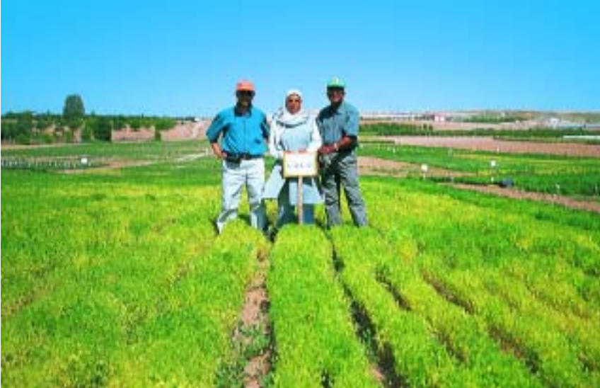
ICARDA and Turkish scientists evaluate the performance of 'Kafkas,' a high-yielding and winter-hardy lentil variety in Turkey.

to Ascochyta blight, and two high-yielding, early-spring varieties were released for Central Anatolia. The varieties are being disseminated among farmers mostly by the Mediterranean Seed Export Company. In addition, CRIFC researchers have identified some winter-hardy lines, which are now at various stages of evaluation.