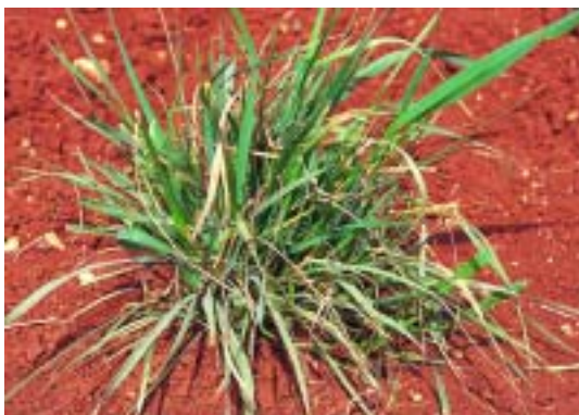
Sunn pest infected wheat plants.

Sunn pest causes severe damage to wheat and barley crops in Central and West Asia, with infestations spreading over 15 million hectares. It causes the damage by feeding on leaves, stems and grains. Yield loss is commonly estimated at 20-30% in barley and 50-90% in wheat. Apart from the direct reduction in yield, the pest also injects chemicals that greatly reduce the baking quality of the dough. Control of Sunn pest by chemical insecticides is expensive, costing over US$ 100 million annually in the countries of Central and West Asia, and poses a risk to human health, water quality and the environment. In Turkey, about 1.5 to 2 million hectares were sprayed against this pest in the past. Efforts to replace the insecticide-based strategies for Sunn pest control with integrated pest management (IPM) options have led to a reduction in the sprayed area to less than 1 million hectares.