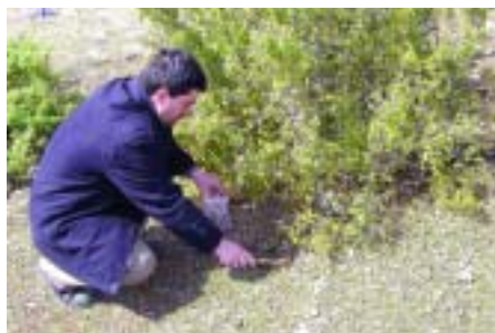
Sampling of entomopathogenic fungi in Gaziantep, Turkey, for their persistence against Sunn pest.

In Turkey, IPM options have been extended to farmers using farmer field schools formed around each of two IPM pilot sites. The main challenge to implementing IPM options for Sunn pest was reliance on chemical control. However, efforts by scientists from Turkey and ICARDA have led to some progress in the use of IPM. Starting from the 2004/2005 season, the Government of Turkey decided to replace the centralized aerial spray with ground application by farmers. This decision will encourage IPM implementation in the country. A national IPM program supported by the Government of Turkey was launched recently, through which farmer field schools will be established throughout the Sunn pest affected areas in the country.