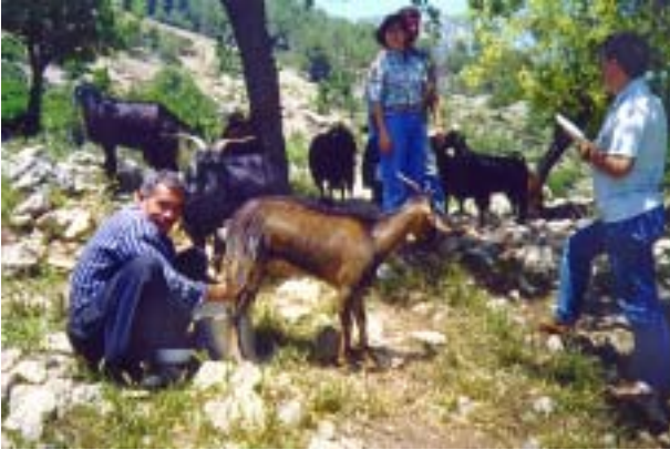
Measuring milk yields in the Taurus Mountains, Turkey.

The project led to the development of improved varieties of wheat, barley and chickpea which have been widely adopted by the farmers. Also, new enterprises were introduced to diversify the incomes of farmers. These included the vetch-oat combination, triticale, sainfoin, and new fruits such as cherry and grapes. Livestock production was also improved. The changes of breeds in animals (cattle, sheep and goat) significantly increased the incomes of farmers. As a result of these technological changes, the incomes of the farmers involved in the project increased by 65%. This project may be considered a model for agricultural development through research, with the participation of farmers, extensionists and researchers.