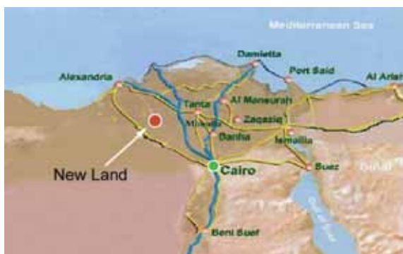
Figure 3.1. The new lands site location at El-Bustan.

Agricultural practices in the newly reclaimed lands (known as new lands)