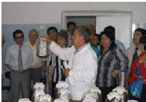
Explaining predatory mites breeding methods

A joint research program on enhancing efficiency and product lines of bio-laboratories was set to focus on predatory mites. It tests colonization and acclimatization of predatory mite Amblyseius sp on bran mites, spider