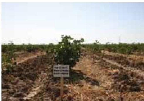
Using hay mulching for effective soil and water management

Institute of Plant Industry, national Corn Station and Institute of Karakul Sheep Breeding and Desert Ecology. Multi-location trials were established under different agro-climatic zones in Uzbekistan that significantly differed in soil salinity level. As a result of the project, germplasm of 42 populations and improved breeding lines varieties of pearl millet ( Pennisetum glaucum ) and 14 varieties of sorghum ( Sorghum bicolor ) were