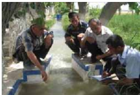
Water accounting in place

Water Productivity Improvement at Plot Level is another IWMI project in Uzbekistan. This project aims at enhancing water productivity at plot level by disseminating knowledge on irrigated agricultural production practices