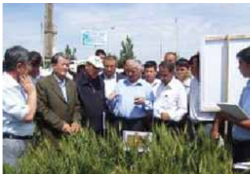
Kashkadarya, Uzbekistan: Wheat breeders discussing crop improvement activities.

Similar collaborative activities are carried out between Uzbekistan and ICARDA in other crops including durum wheat, barley, chickpea, lentil, faba bean and grass pea. These collaborative activities in crop improvement in Uzbekistan are undertaken primarily in partnership with the research institutes of Uzbek Scientific Production Center for Agriculture and Tashkent State Agrarian University.