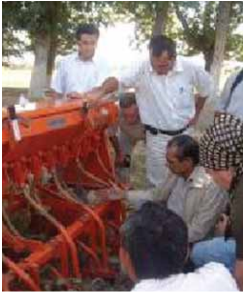
Farmers discuss new conservation agriculture equipment

Conditioning Plant was installed in Uzbek Research Institute of Plant Industry. Currently, this machine is working well and the farmers neighboring the Institute are processing their wheat seeds for planting.