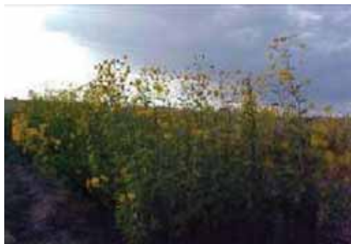
Central Kyzylkum, wild bushes of halophytes ( Climacoptera lanata )

Two salt tolerant varieties of alfalfa ( Medicago sativa ), Eureka and Skeptre, introduced by ICBA were found to outperform the local variety Khivinskii (used in Karakalpakstan), while the Kyzylkeseksaya variety (Central