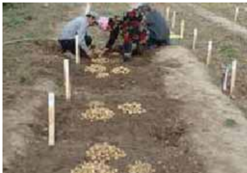
Pskem, Bostalnik district, Uzbekistan. Harvest of seedling tubers from True Potato Seeds (TPS) families

The lack of appropriate extension system available at the national level has been a major constraint. Due to limited budget resources, CIP focused its efforts on the development of local initiatives, mainly in the