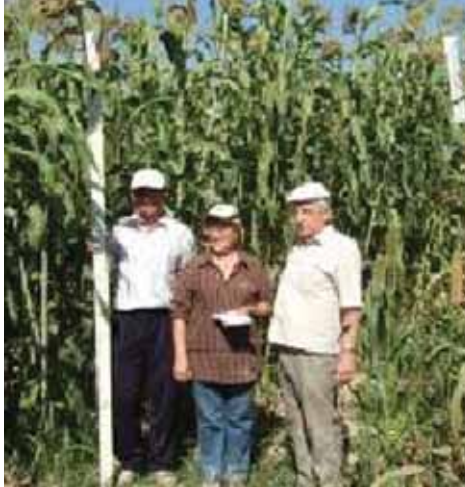
Sorghum, a nutritional and highly-productive dual-purpose crop

Introduced sorghum varieties and/or improved lines from ICBA and ICRISAT germplasm had significantly higher growth rates, plant height, yield of fresh and dry biomass and seed production during the vegetative stage than those of locally planted varieties. Among the 42 populations and improved breeding lines of pearl millet that have been tested so far, 8-12 genotypes showed tolerance to abiotic stress (salinity, heat and drought) with high-yielding (both forage and seed production) ability, thus being suitable for spring planting as the main crop in non-saline and moderately saline areas in Uzbekistan. Improved early-