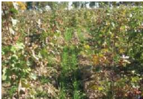
Winter wheat growing on cotton field

The project was executed by the Ministry of Agriculture and Water Resources of Uzbekistan, with on-site technical guidance and support provided by ICARDA and competent national and regional institutes and agencies. The