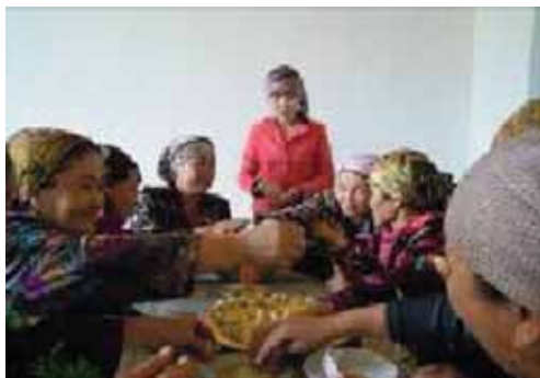
Cooking "dual purpose" crop dinner

In 2010, ICARDA in cooperation with ICBA started the project " Strategic dual purpose crops and mobilization of underutilized plants as part of a climate change adaptation strategy. Case study in semi-desert, foothill rangelands near Papanaya settlement, Nurata district ", which is funded by the German Ministry for the Environment, Nature Protection and Nuclear Safety, within